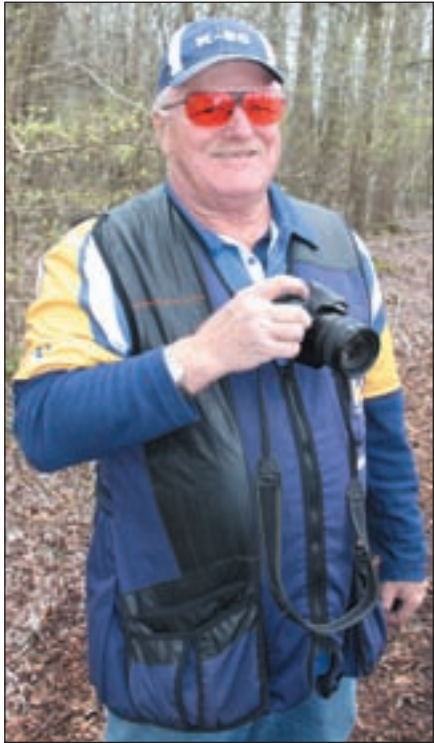
Moore enjoys shooting sporting clays and spending time outdoors when he isn't working 70-hour weeks.

DM: I knew straight away, after working on my first hot water heating system, that I wanted to work on and specialize in hydronic systems. I attended an I=B=R seminar back in the 1980s and it just clicked for me. From