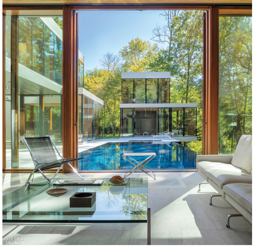
The living room's lounge chair, folding stool, sofa, and coffee table are all by Kjaerholm.