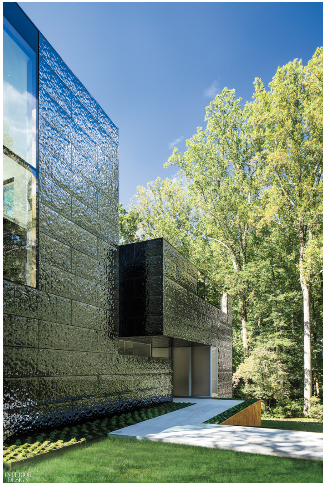
In lieu of walkway lights or exterior wall fixtures, illumination for the front door is provided by ceramic-fritted glass panels backlit from inside the house.

Jameson is no stranger to formalist invention. His past designs include houses based on the molecular structure of salt, the manifolds of vintage Italian scooters, and the crisp, gabled sheds that are the stock-in-trade of the vernacular-modernist architect Hugh Newell Jacobsen