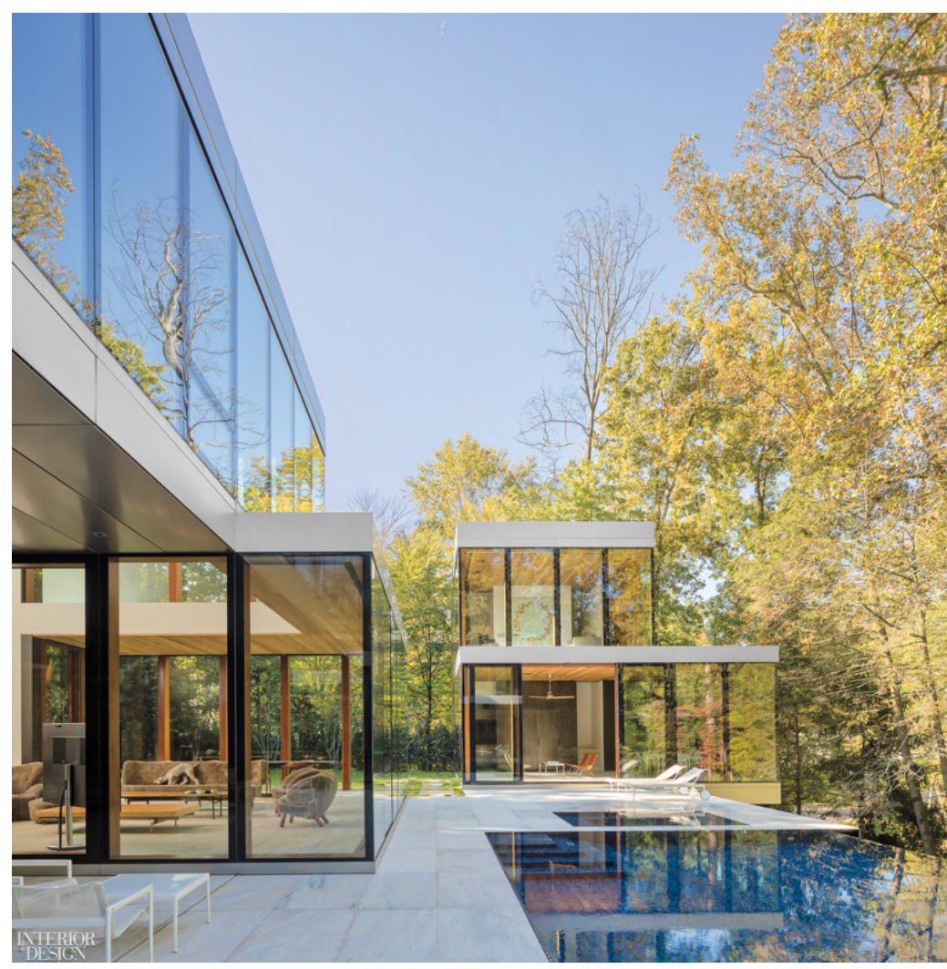
Beyond the lap pool and spa is a two-story pool house.