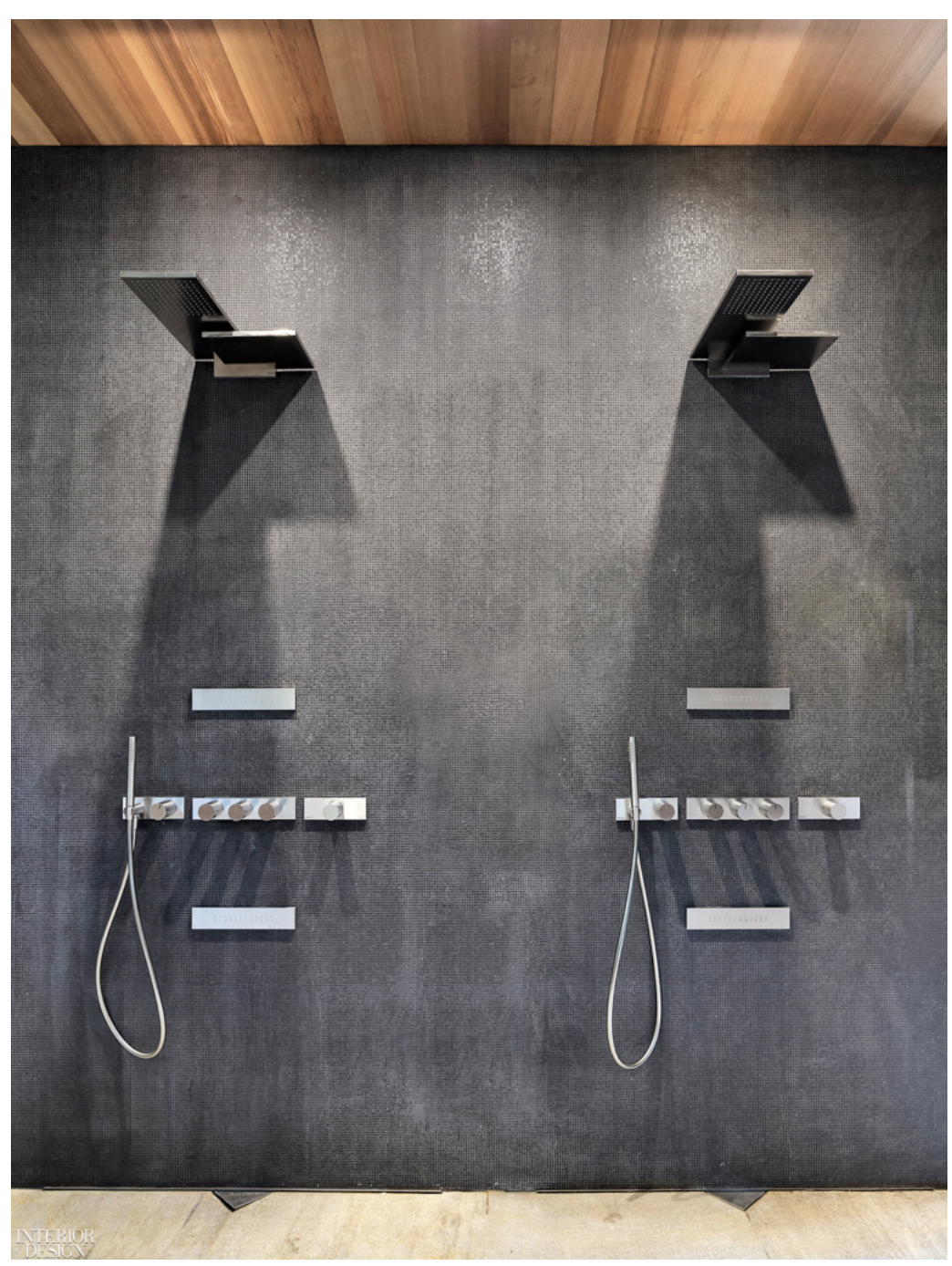
The ground-glass tiles of the master bath's shower wall, which features Carlo Scarpa-reminiscent showerheads by Franco Sargiani, were crafted from recycled computer monitors.