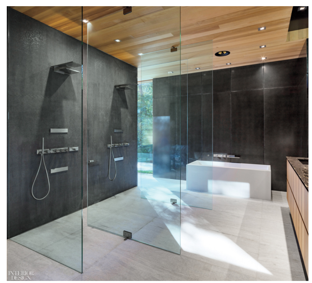
A pair of pivoting glass panels separates the double shower from the rest of the master bath.