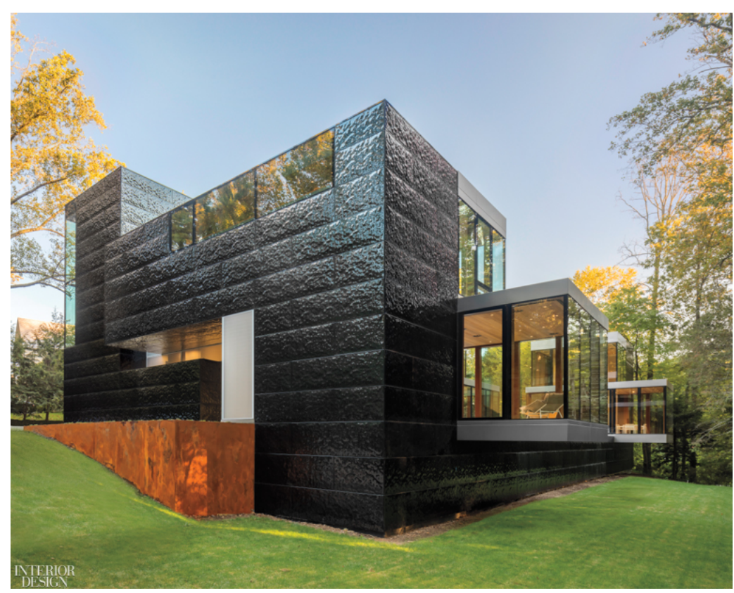
Crisp glazed volumes pop from the house's rough-hewn stainless-steel facade.

Like the undulating surface of a dark-bottomed pond, the metallic skin refracts light and reflects the surrounding landscape of earth and sky in endlessly changing, miragelike ways. "On a foggy day, it's whitish gray; on a bright one, it pops, becoming a reflective white," Jameson reports, calling to mind photographer Hiroshi Sugimoto (https://www.sugimotohiroshi.com/)'s luminescent seascapes.