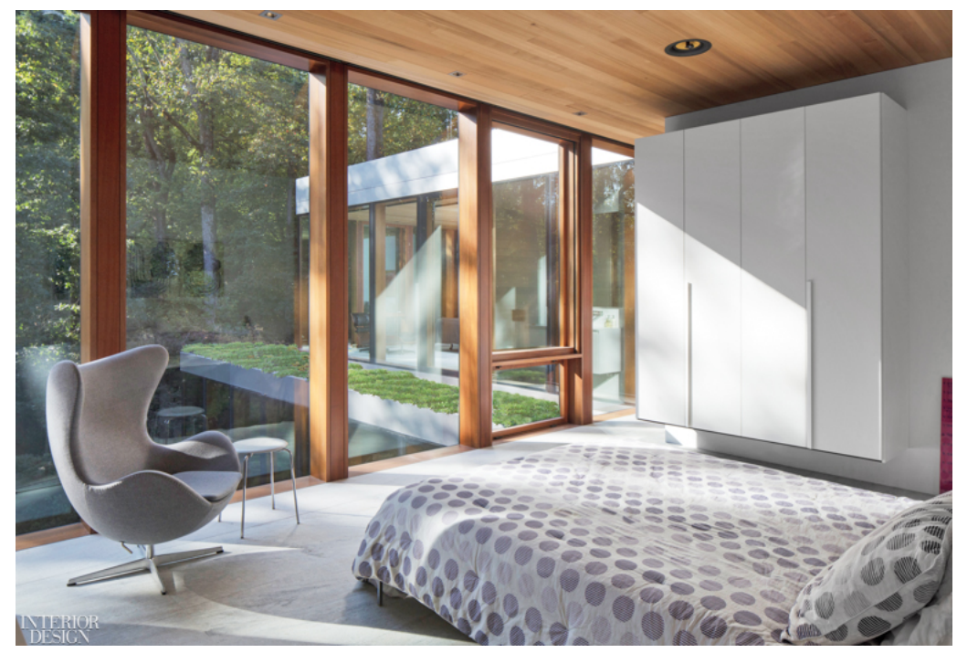
African mahogany wraps structural columns and window frames in a child's room.